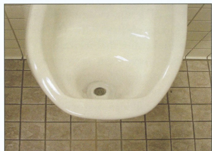
This is a picture of the same urinal after it was cleaned with a mild acid to remove all the staining and hard water buildup.