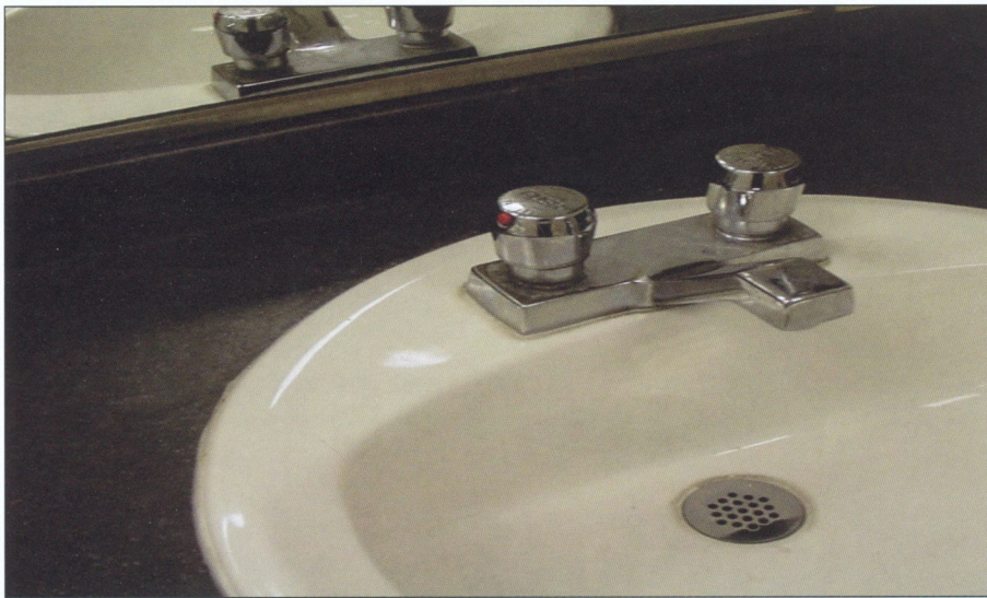
This sink was being cleaned by a company 7 days a week in a ladies' room. This photo was taken minutes after the vendor completed its daily cleaning. It was cleaning with a hospital-grade germicidal detergent, a glass cleaner, a neutral-based detergent and a bowl cleaner. Yet it was not able to remove the hard water buildup and staining around the faucets and sink drain.

Cleaning is an activity, a process and a form of management. For instance, cleaning a restroom includes the activity of trash removal, the process of orderly filling dispensers and management of the cleaning process including the sequence of tasks. Clean restrooms don't just happen by accident. It takes good planning and management to provide safe, clean and healthy restroom facilities.