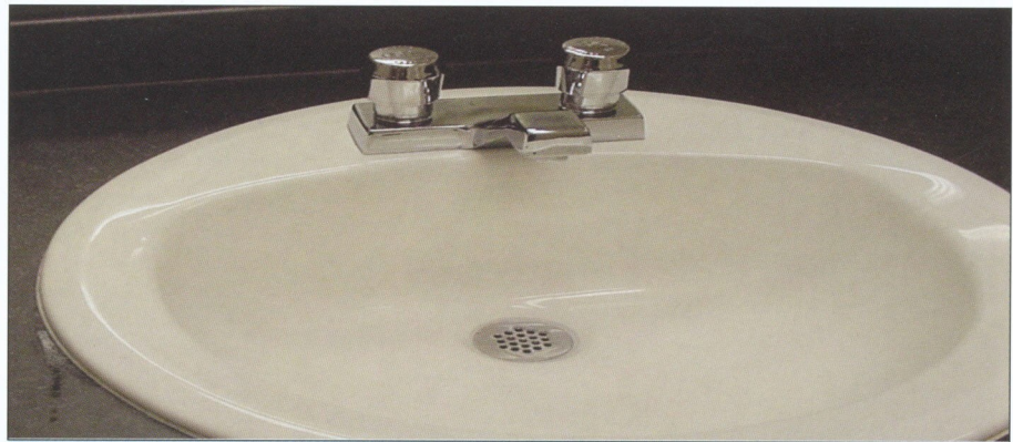
It took the cleaning crew 4 minutes to clean this sink using a mild acid and brush followed by rinsing to remove all the staining and hard water buildup.

Facility management is now considered to be a critical component of operational consistency and organizational strength. Facility budgets address a complex array of expenditures from technology to personnel, capital improvements to staff training. Facility managers must understand basic and complex financial concepts. They need to also understand that their facilities department is a cost center and that their department's budget is a significant portion of a company's overhead budget and will always be