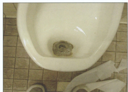
This is a picture of a urinal in a men's room at the same store. The restroom was being cleaned by an outside company 7 days a week. Note the staining and water buildup.